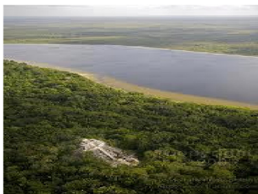
View of New River from temple

Cost is $375.00 + 12.5% Tax per person (Minimum 2 persons).