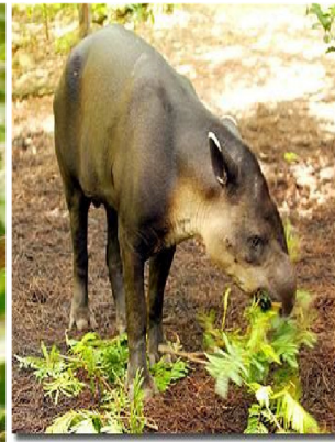
Tapir (national animal)