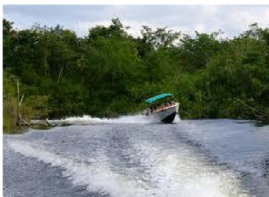
Boat ride to Lamanai

$350 per person, plus 12.5% tax per person (Minimum 2 persons).