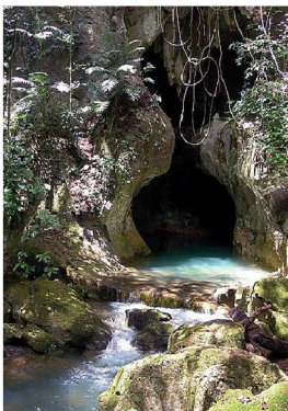
Entrance of cave

$425 per person, plus 12.5% tax per person (Minimum 2 persons)