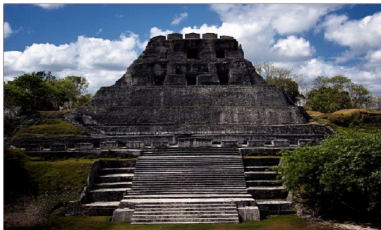
"El Castillo" Mayan Temple

$375 per person, plus 12.5 % tax (Minimum 2 persons)