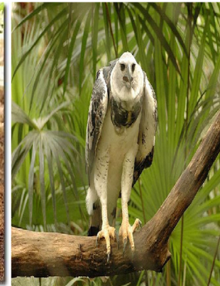
Extinct species Harpy Eagle