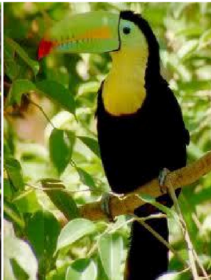
Toucan (national bird)