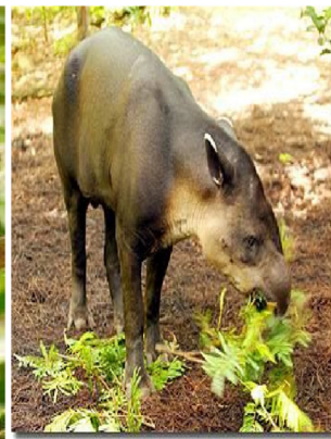
Tapir (national animal)