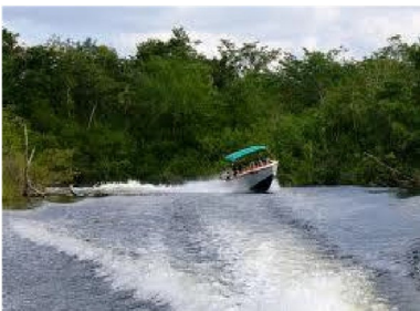
Boat ride to Lamanai

$350 per person, plus 12.5% tax per person (Minimum 2 persons).