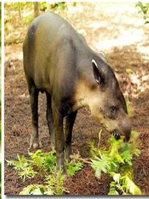
Tapir (national animal)