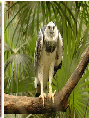
Extinct species Harpy Eagle